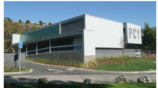
New Multi-Purpose Room at PCY